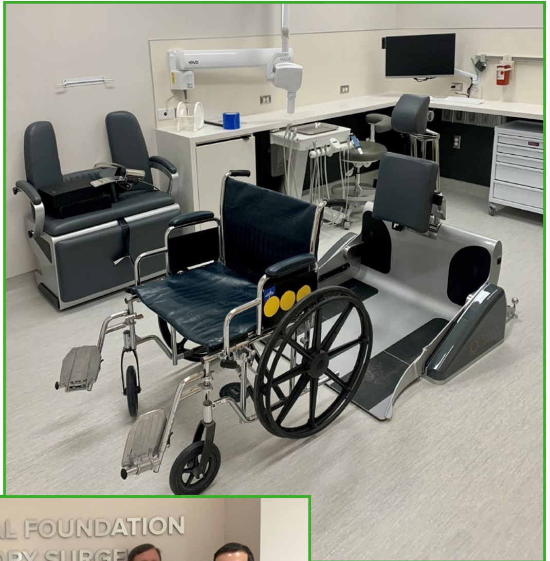
University of Michigan School of Dentistry's Delta Dental Integrated Special Care Clinic

All of the above work—and more—inspired Delta Dental of Michigan, Ohio, and Indiana to design and offer enhanced benefits for children and adults with special health care needs. You can learn more about it here .