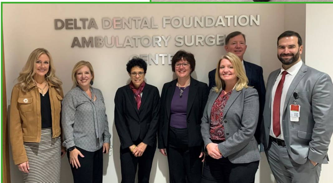
The Ohio State University College of Dentistry's Delta Dental Foundation Ambulatory Surgical Center.